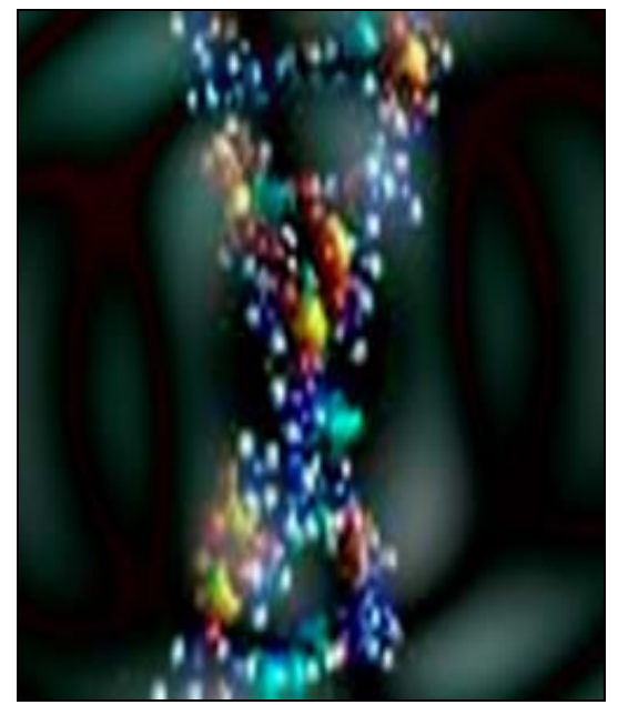
A wide range of viruses and other infectious agents, such as Epstein-Barr Virus, Human Herpesvirus-6 and 7, Enterovirus, Cytomegalovirus, Lentivirus, Chlamydia and

Myalgic encephalomyelitis (ME/CFS) is a severe systemic, acquired illness that is defined by the WHO in the ICD-10 code G93.3 as a neurological illness and officially accepted as such by the UK government. ME/CFS has clear clinical symptoms which manifest predominantly based on neurological, immunological and endocrinological dysfunction. While the pathogenesis is suggested to be multi-factorial, the hypothesis of initiation by a viral infection has been prominent.